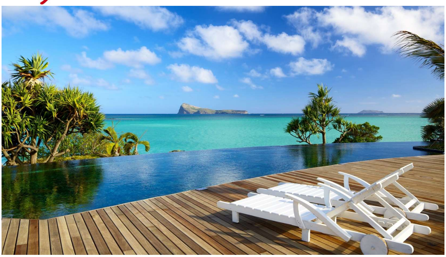
Mauritius - 6 days